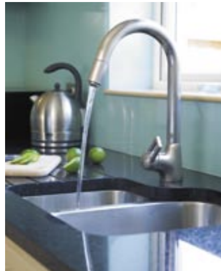
▲ A stylish ring-pull-lever tap with pull-out spout complements the kitchen's sleek lines and matches Jackie's stainless-steel appliances

A curved-end maple cabinet with glass doors softens the division between the kitchen and the dining area, and is backlit to display Jackie's assortment of glassware. The walls are painted in Chinese Jade by Dulux for a fresh, airy feel