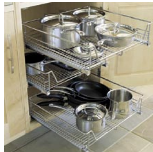
▶ Pull-out, stainless-steel racks put a stop to fumbling in cupboards for pots and pans. Here, saucepans can be matched with their lids and bakeware is easily retrievable. The smooth side runners ensure that lids stay on top of the pans when the racks are pushed shut. The muted Ardesia Dorata porcelain floor tiles from Smith & Wareham are the perfect partner to the maple cabinetry